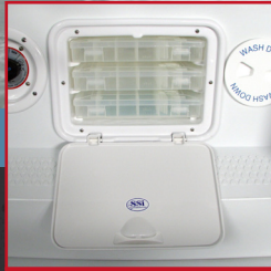
Built-in tackle trays