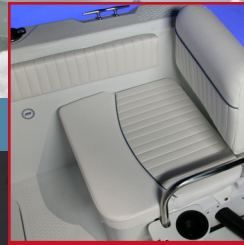
Aft bench seats